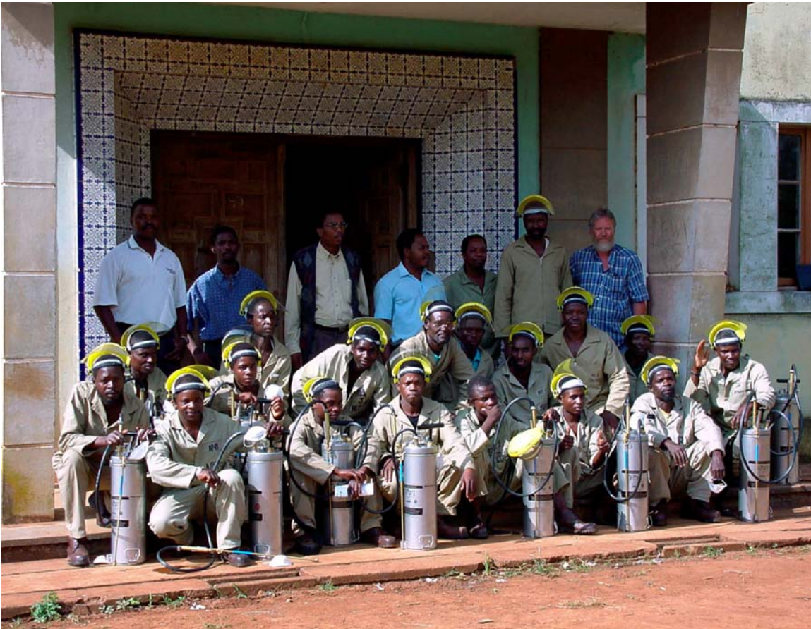
(Photographer – Francois Maartens (MRC-SA), Namaacha, southern Mozambique, 2000)

1050 17 th Street, NW Suite 520 Washington DC, 20036 United States