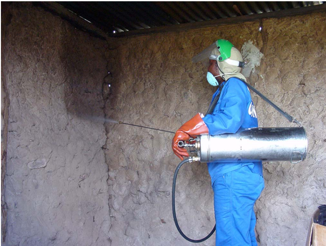
(Mbazwana, KwaZulu-Natal 2002)